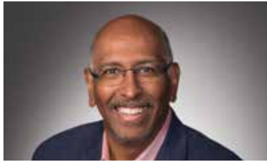
The Hon. Michael Steele