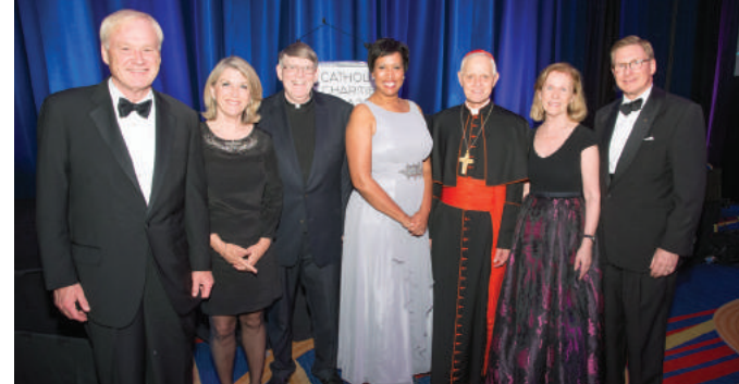
Catholic Charities Gala, April 2017 /Washington Marriott Wardman Park Hotel