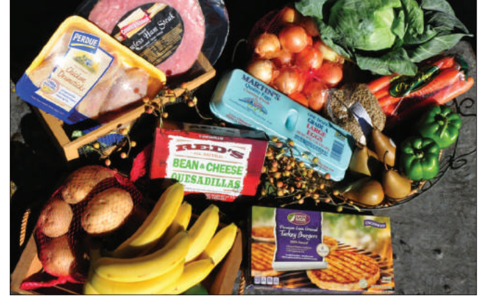
Nutritious and affordable food package from SHARE Food Network.